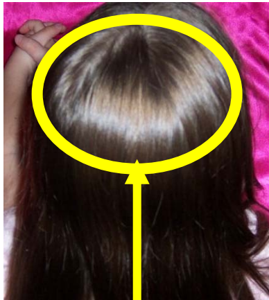
Occipital Region of Scalp