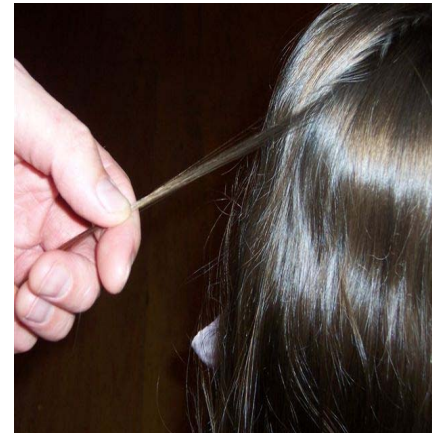
Place the KID ID label tightly around all 20 strands.