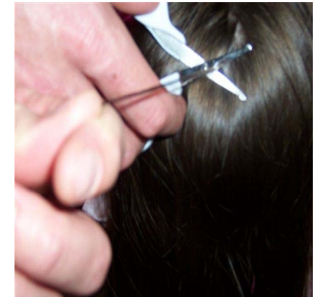
Cut the hair sample off the participant's head as close to the scalp as possible .